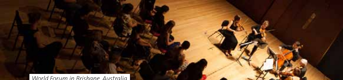
World Forum in Brisbane, Australia