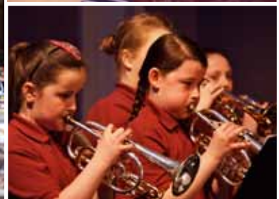
3 rd European Forum on Music, April 2013, Glasgow, Scotland