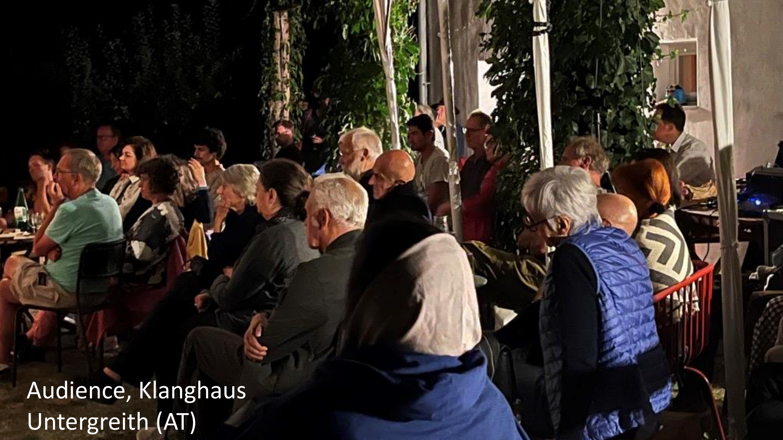
Audience, Klanghaus Untergreith (AT)