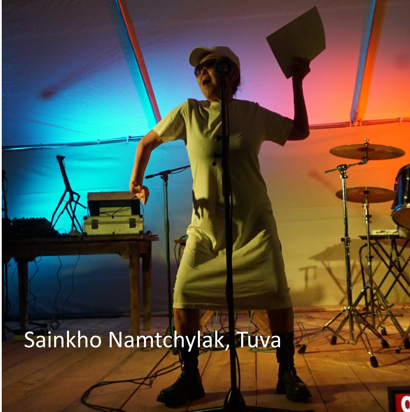
Sainkho Namtchylak, Tuva